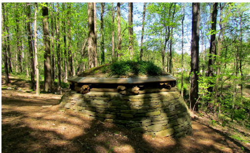
Cloud Chamber for the Trees and Sky, Raleigh, NC Outdoor art installation features a camera obscura.