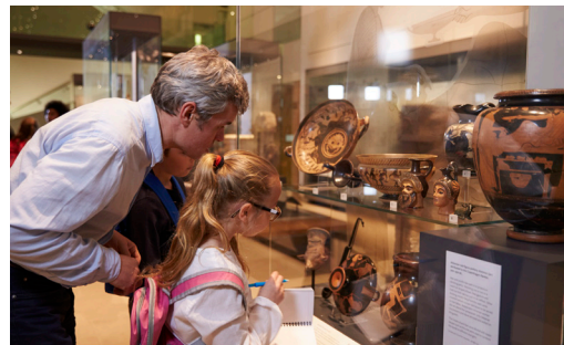
Berman Museum of World History, Anniston, AL Museum holds over 6,000 pieces of art, antiquities, arms and armor.

Enjoy your adventures and when you return from your travels, I'll be here to answer any questions you may have about the market!