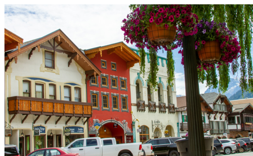
Leavenworth, WA Bavarian-styled village in the Cascade Mountains of central Washington.