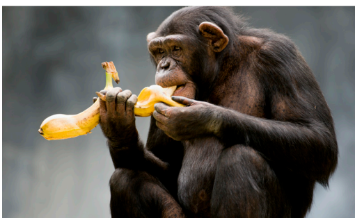
Chimp Haven, Keithville, LA Over 300 chimpanzees reside at this 200-acre nonprofit sanctuary.